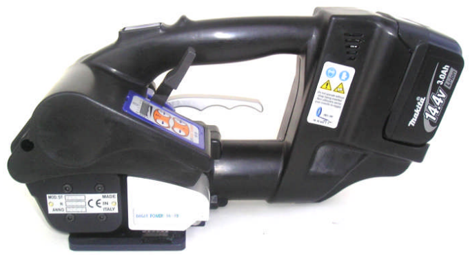
NEW DIGITAL ADJUSTMENT SYSTEM FOR TENSION AND SEALING TIME